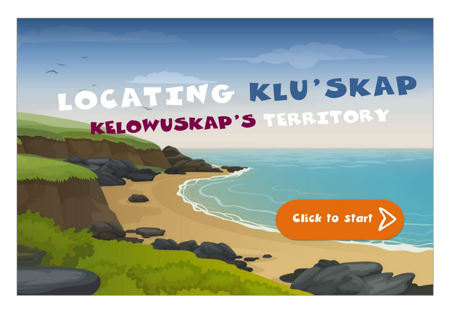
Lesson D — Activity 1 Klu'skap / Keluwoskap and His People